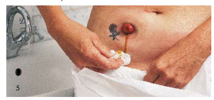
Cleanse your stoma and the surrounding skin thoroughly.