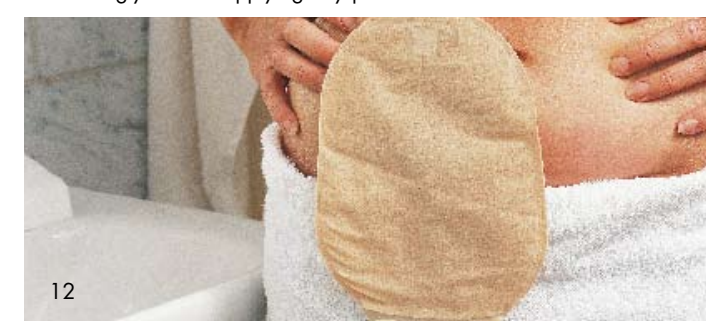
Make sure the drainable end of the pouch is closed.