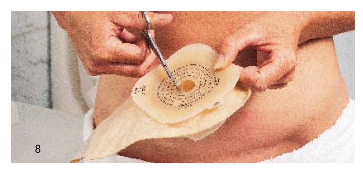
If your stoma is uneven or oval adjust the hole in the pouch with small, sharp scissors or use the tip of your finger to adjust the hole to the correct stoma diameter. Remember it is important that the hole fits your stoma snugly without applying any pressure.