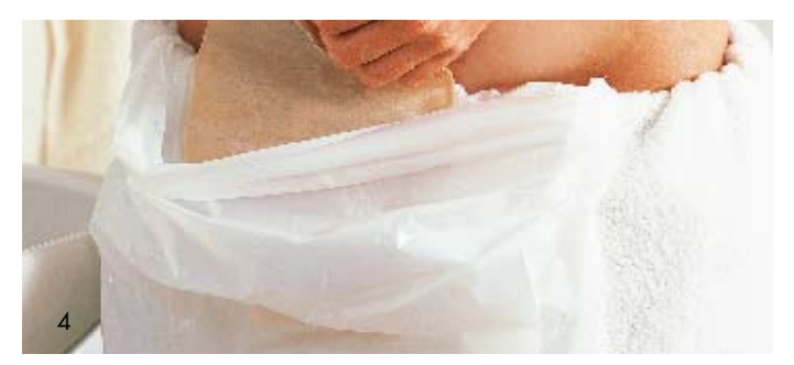
As an added precaution, to avoid spillage and to collect used materials, place a disposal bag in your waistband.

It is important to be prepared and have all the equipment you require at hand before starting to change your pouch.