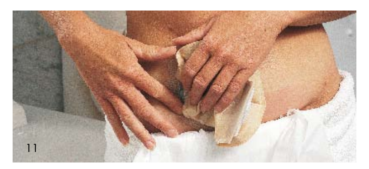
Press the adhesive from centre to edges to ensure it is securely in place.