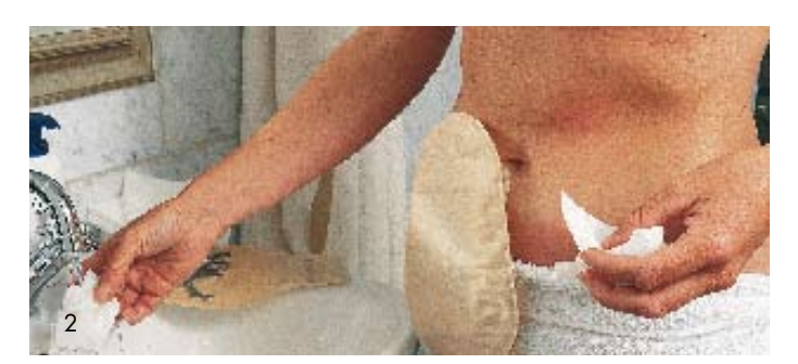
Dampen a few non-woven wipes in lukewarm water.