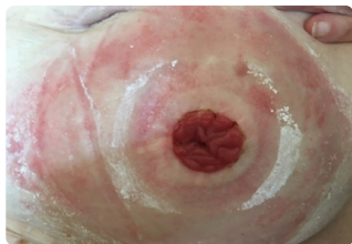
One week post Dansac NovaLife TRE barrier - visual improvement in skin health.